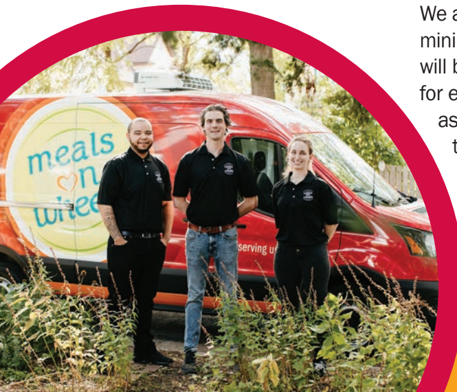
Meals on Wheels delivery staff have been busy with extra deliveries

"It's day by day," he says. "I don't have a lot of money but what I have is getting me through. I'm getting better and better and stronger and stronger. I definitely have faith now that I got that kidney and Meals on Wheels."